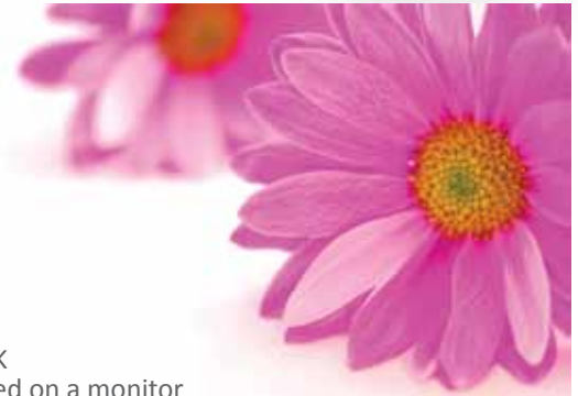
CMYK viewed on a monitor

Your choice of paper will also impact color. A smooth uncoated paper will give colors a more muted appearance, while a coated or gloss paper will add vibrancy. Printing on colored paper will also impact color.