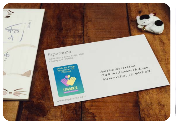
Easy to personalize in specific shapes and sizes. We offer short runs for small businesses and large-scale production for bigger campaigns, so it fits any client's needs.